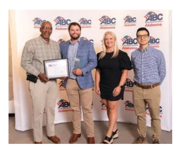
Dunn Construction Company, Inc »