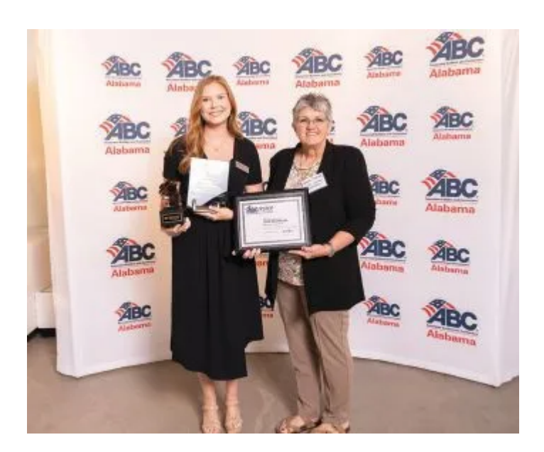
White-Spunner Construction, Inc. »