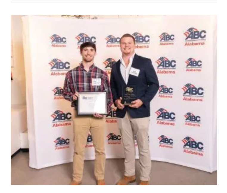
Rabren General Contractors, Inc. »