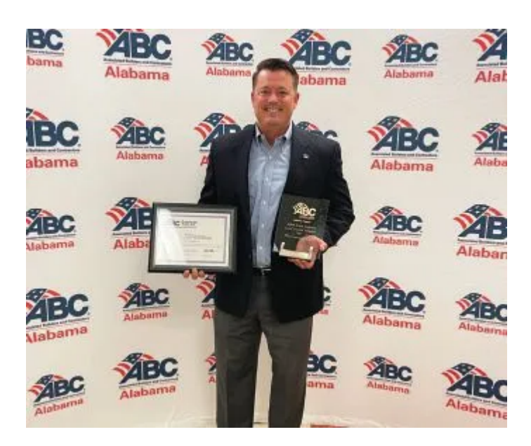
Hoar Construction, LLC »