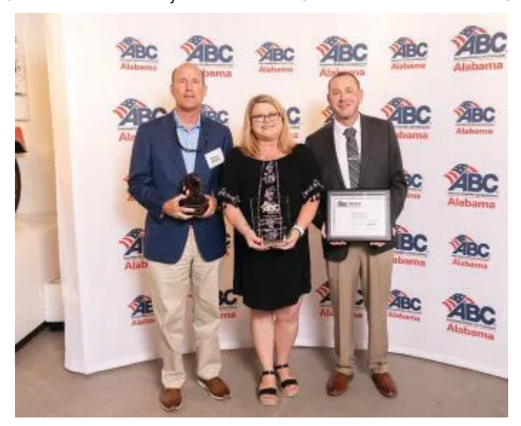
Dunn Building Company, LLC »