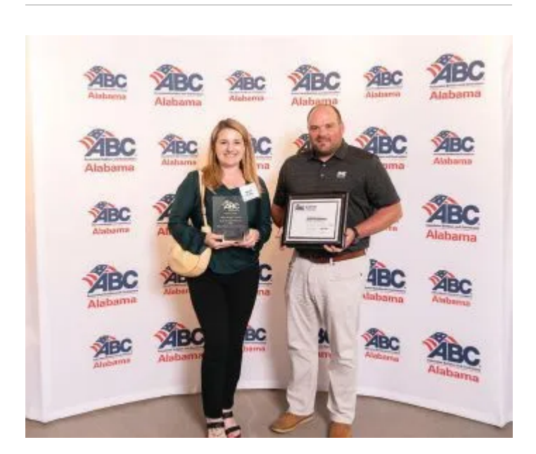
M.J. Harris Construction Services »