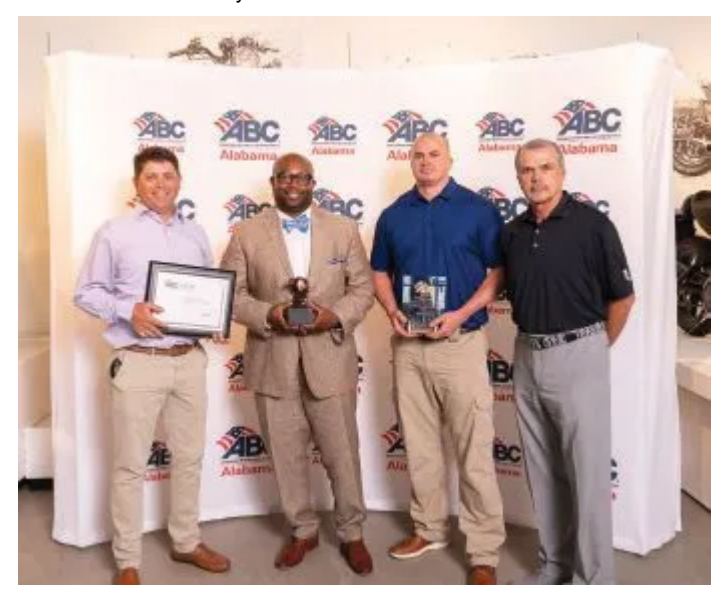
ELDECO, Inc. »