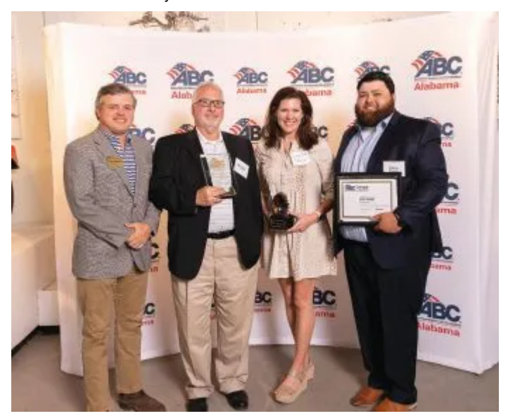
Stone Building, LLC »