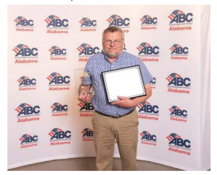
JESCO, Inc. »