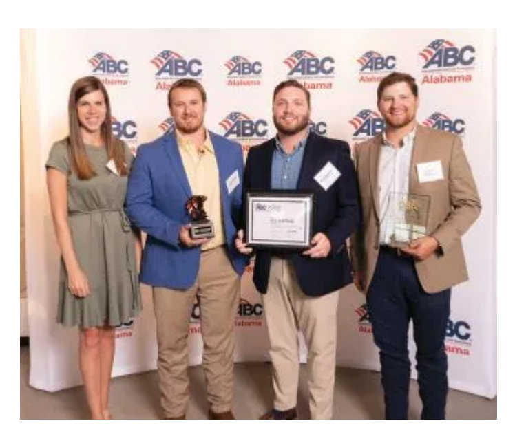
Brasfield & Gorrie, LLC »