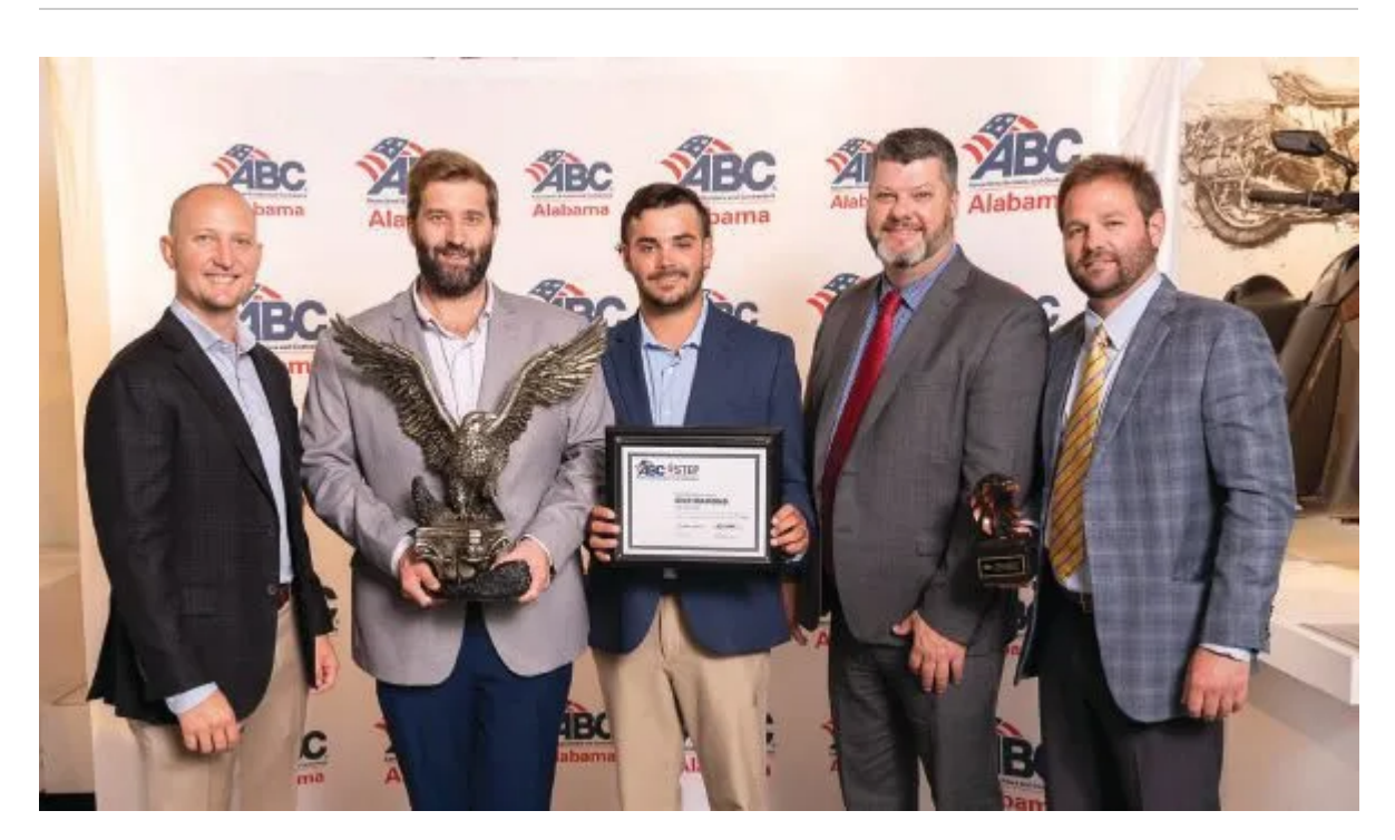
Gray Construction - General Contractor »