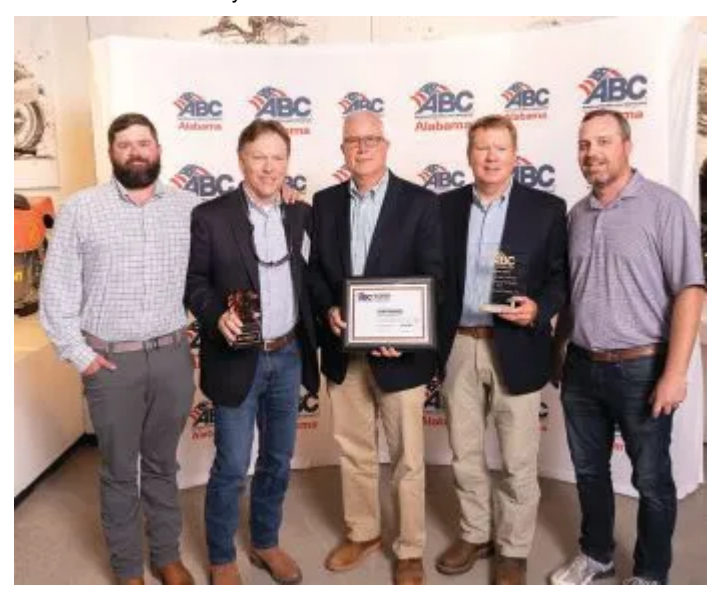
Premier Service Co. »