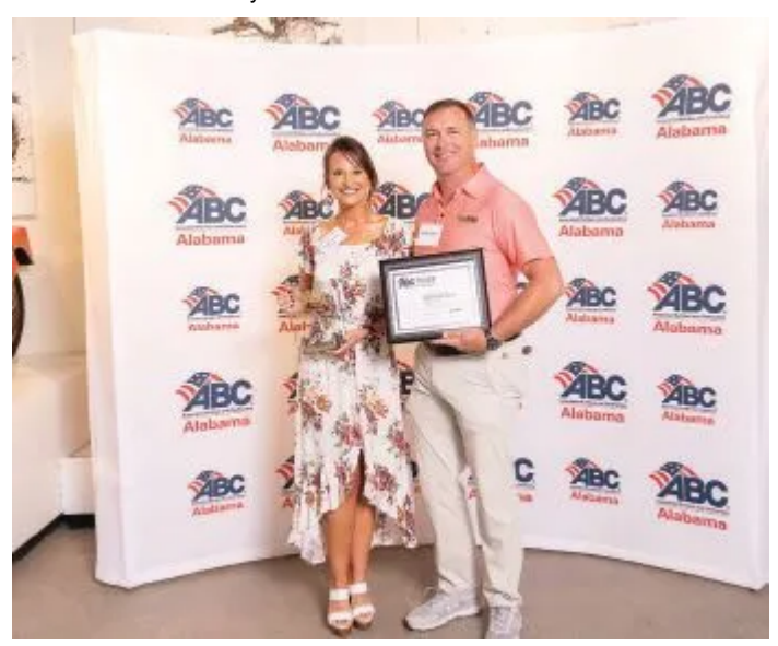
Bright Future Electric, LLC »