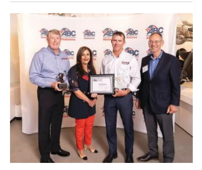
Building & Earth Sciences, Inc. »