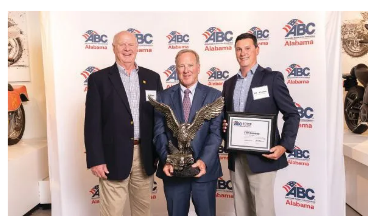
Thompson Engineering, Inc. - Other/Specialty Category »