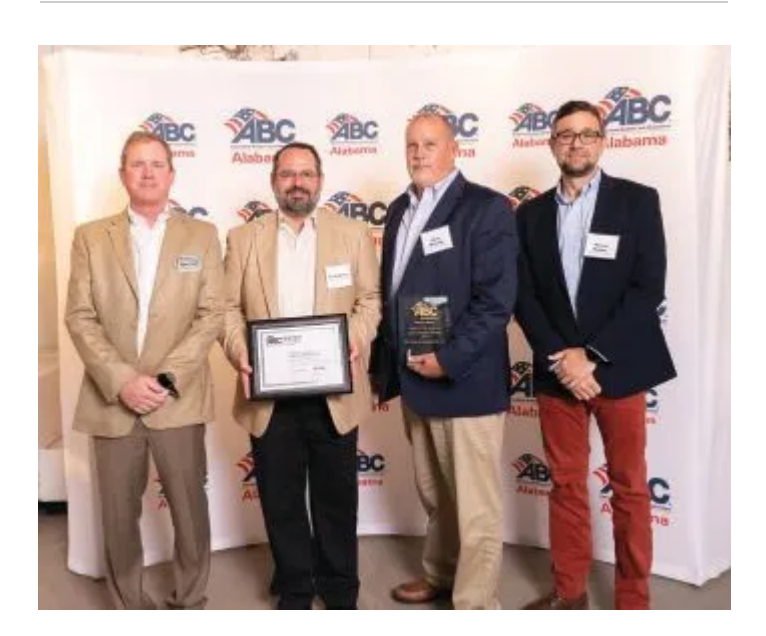
Jim Cooper Construction »