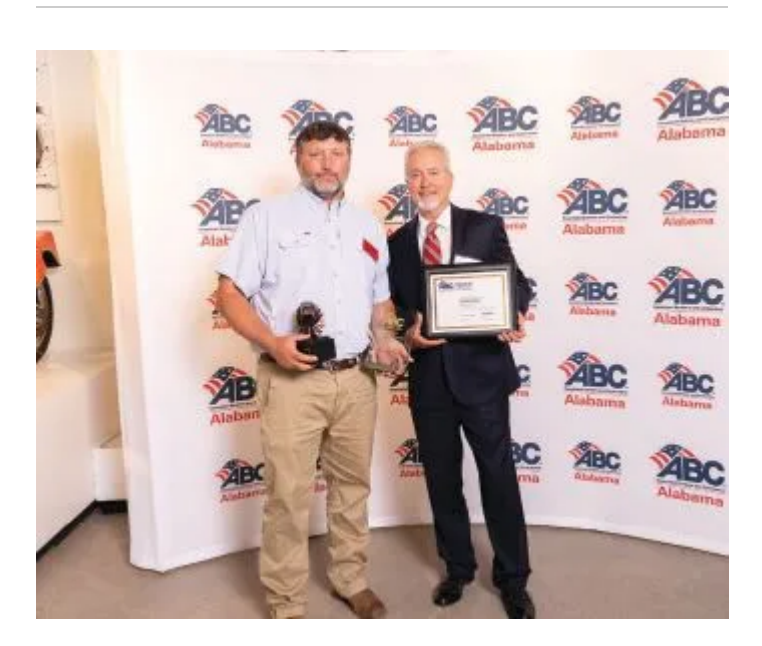
McInnis Construction, LLC »