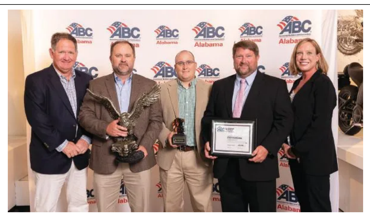
C.S. Beatty Construction - Subcontractor Category »