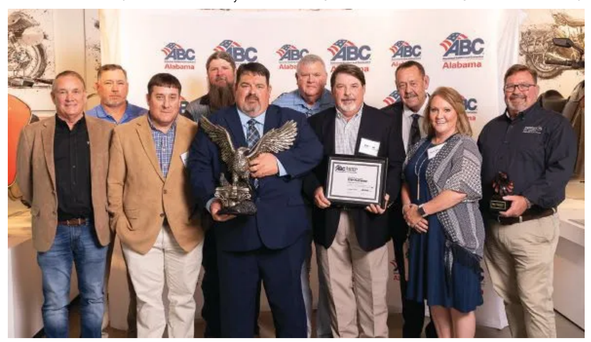
Comfort Systems USA-Midsouth - Subcontractor Category >>