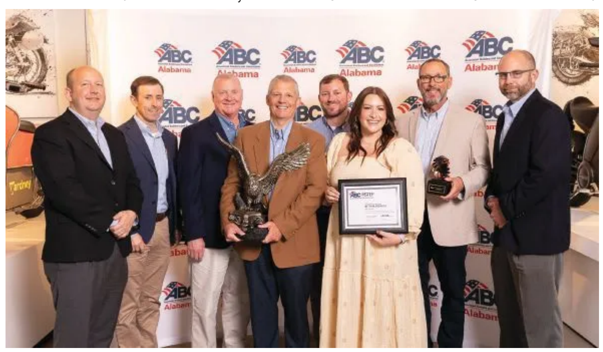
Robins & Morton - General Contractor »