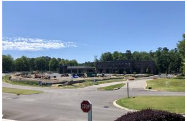
COMMUNITY BANK OF MISSISSIPPI

The Mississippi-based bank closed on the 3.05-acre property yesterday for $1.575 million, or about $516,393 per acre, according to Jefferson County public records. The seller was 8001 Liberty Parkway LLC, an affiliate of Stone Building Co.